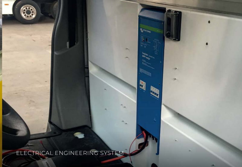
ELECTRICAL ENGINEERING SYSTEM