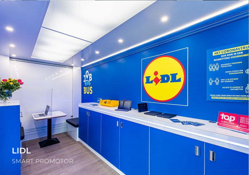
LIDL SMART PROMOTOR