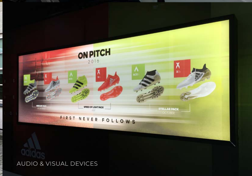
AUDIO & VISUAL DEVICES