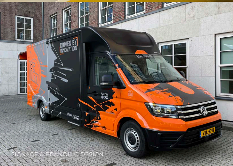
SIGNAGE & BRANDING DESIGN