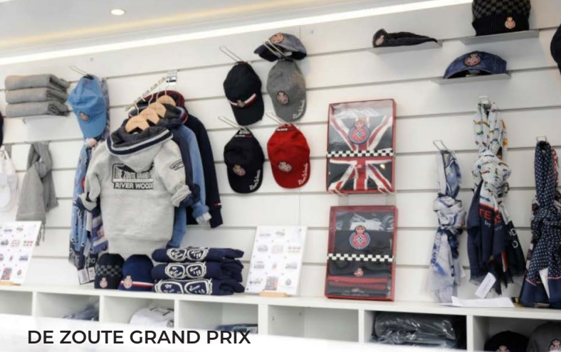
DE ZOUTE GRAND PRIX SMART MERCHANDISER