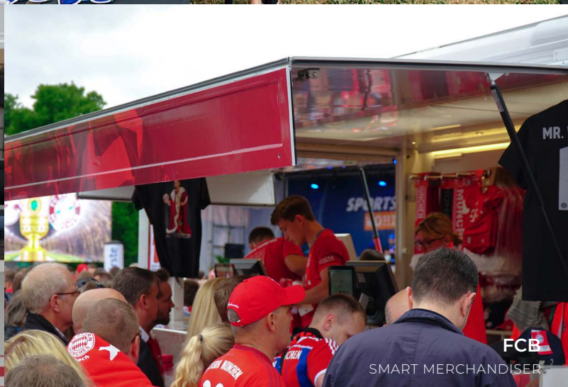
FCB SMART MERCHANDISER