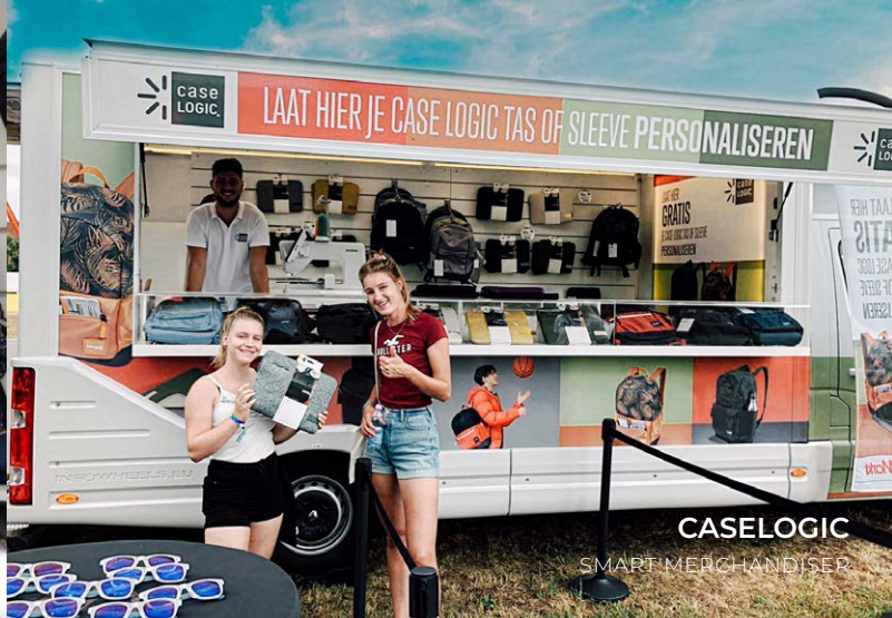
CASELOGIC SMART MERCHANDISER