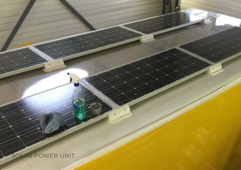
SOLAR POWER UNIT