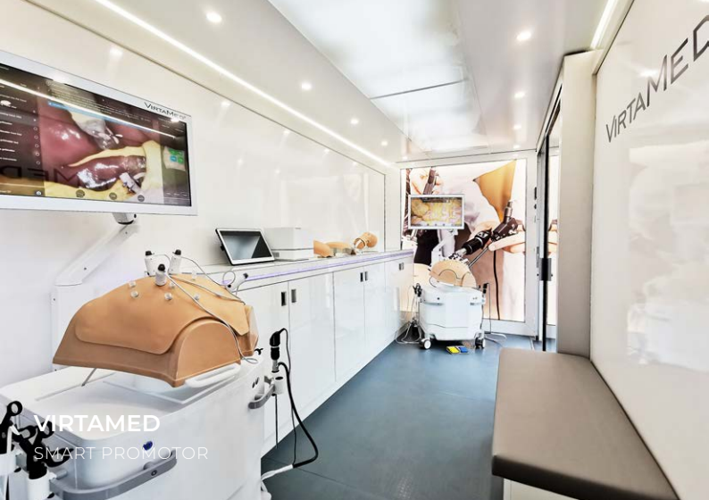
VIRTAMED SMART PROMOTOR