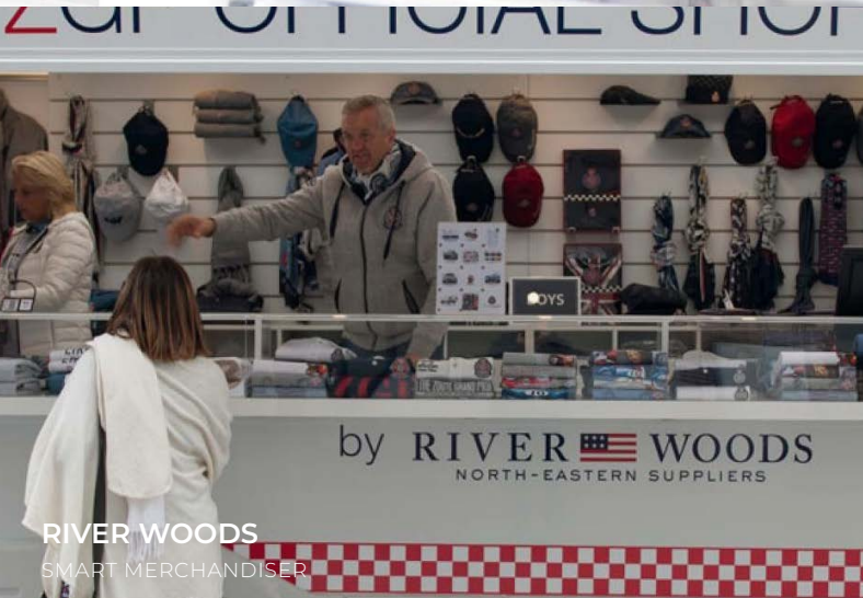
RIVER WOODS SMART MERCHANDISER