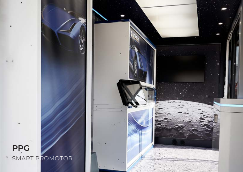
PPG SMART PROMOTOR