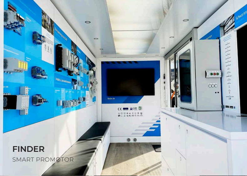
FINDER SMART PROMOTOR